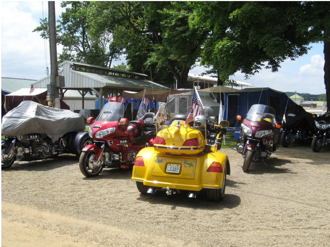
Camp site hang out. Buckeye Rally, June 11-13, 2009, Wooster, Ohio